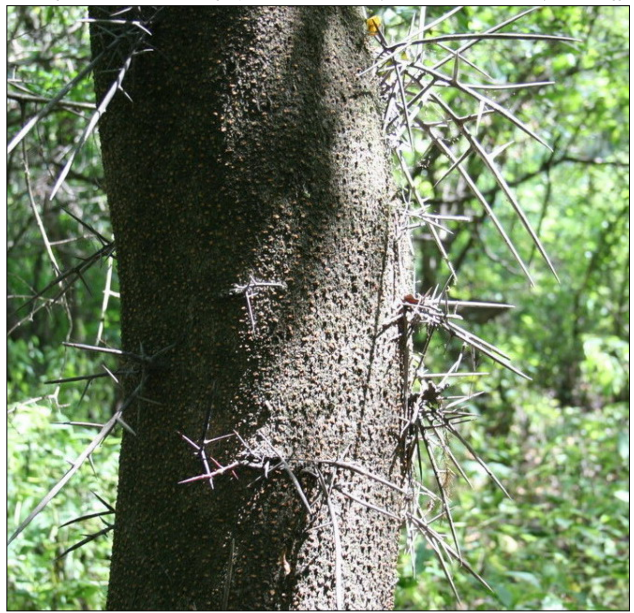
Switching to the new ENTS discussion group is nowhere near as thorny as this water locust.