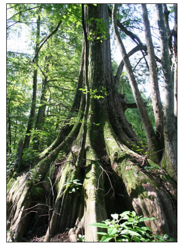
The current co-national champion baldcypress from Mississippi, with its extremely swollen base and rapid taper.

is almost always the winner because girth counts for more than height. In fact, in the current champion tree formula, one inch of girth counts the same as twelve inches of height, since girth is measured in inches and height in feet. What if a tree has a large butt swell, but then narrows down quickly, such as the baldcypress shown below? Is the current champion tree formula sensitive to such a radical change in trunk shape? The answer is "no," and that, for ENTS, is a fatal flaw.