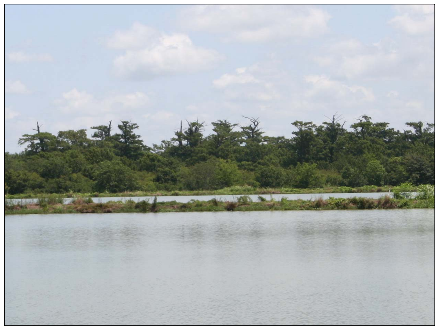
Sky Lake Wildlife Management Area in west-central Mississippi still contains a large quantity of ancient baldcypress that once dominated much of the Mississippi River alluvial plain.

Accepted materials will also need to be accompanied by an author contract granting first serial publication rights to the Bulletin of the Eastern Native Tree Society and the Eastern Native Tree Society. In addition, if the submission contains copyrighted material, express written permission from the copyright holder must be provided to the editor before publication can proceed. Any delays in receiving these materials (especially the author contract) will delay publication. Failure to resubmit accepted materials with any and all appropriate accompanying permissions and/or forms in a timely fashion may result in the submission being rejected.